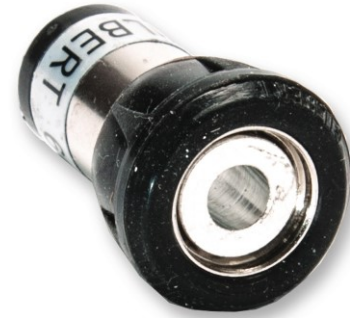
Part Number: GA-RCA-UE-6