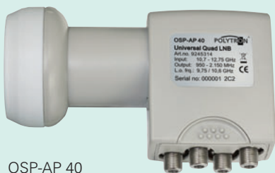
OSP-AP 40 Universal-Quad LNB

3 Jahre Garantie years warranty all Professional Line LNBs