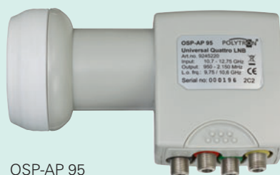
OSP-AP 95 Universal-Quattro LNB