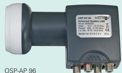
OSP-AP 96 Universal-Quattro LNB